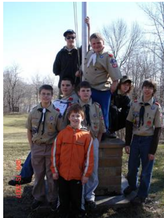
Scouts gathered around the flagpole