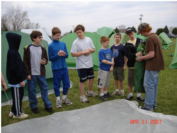
How many Boy Scouts does it take to check a sheet of plastic? One, the others are just standing around!

Saturday, April 21, Scouts, Leaders and Parent volunteers prepared, organized and cleaned the troop equipment for another summer of camping. All the troop tents (21) were set-up, cleaned and inspected. The new tents were seam sealed and hung to dry. The Patrol boxes (2 complete, 1 partial) were emptied cleaned and inventoried. All tote bins were sorted, organized and labeled.